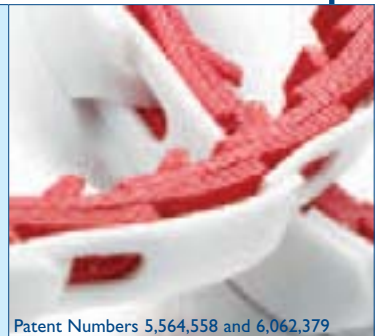
Patent Numbers 5,564,558 and 6,062,379