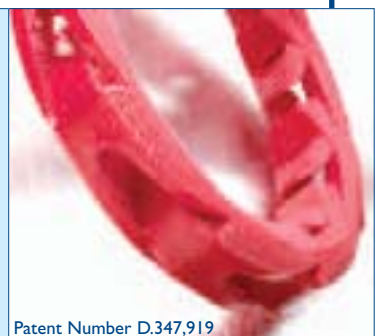
Patent Number D.347,919

Designed specifically to replace round profile rubber, urethane and leather belts. Extremely flexible and ideally suited for use with small pulley/idler diameters.